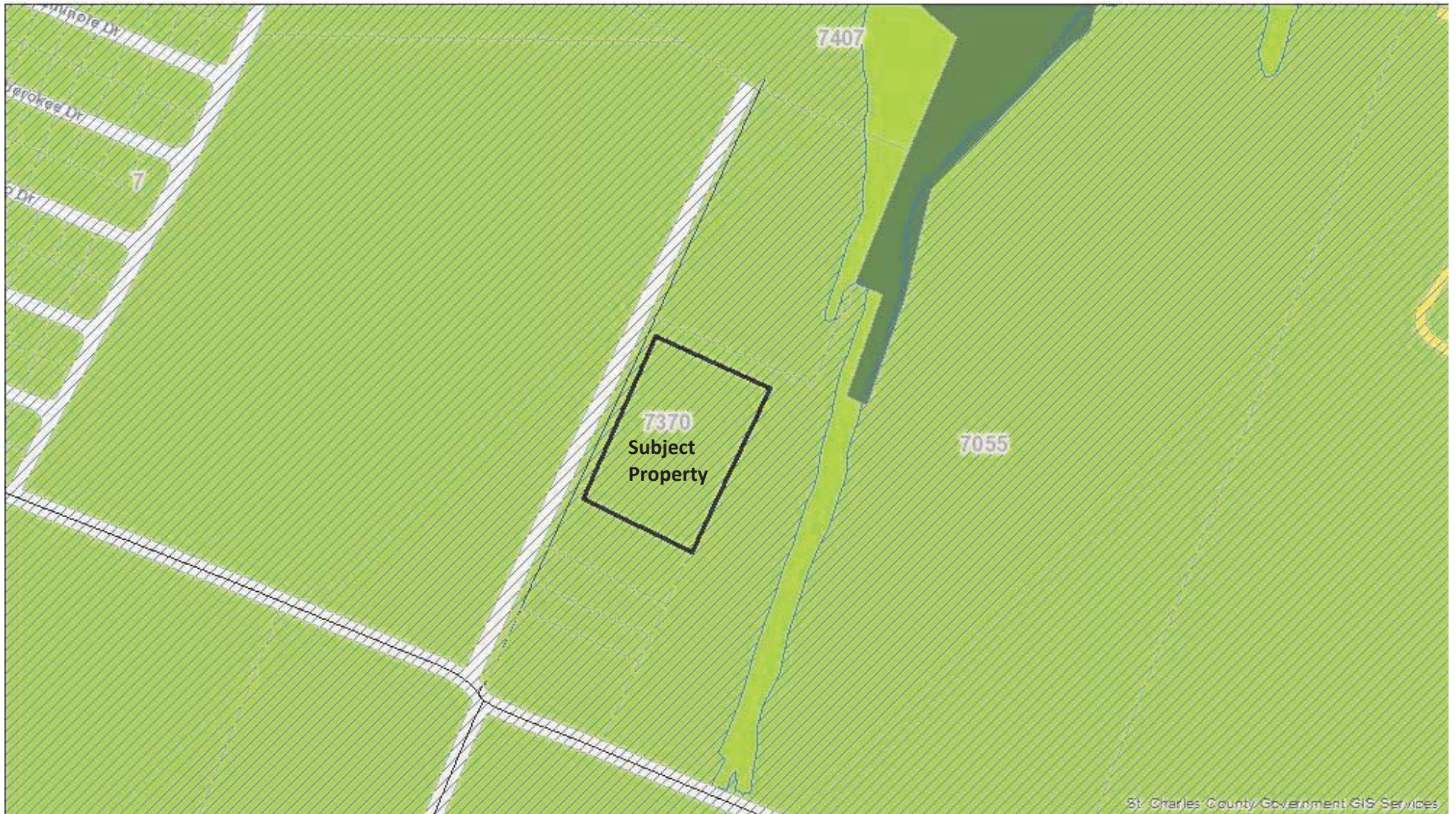
RZ19-11 Future Land Use