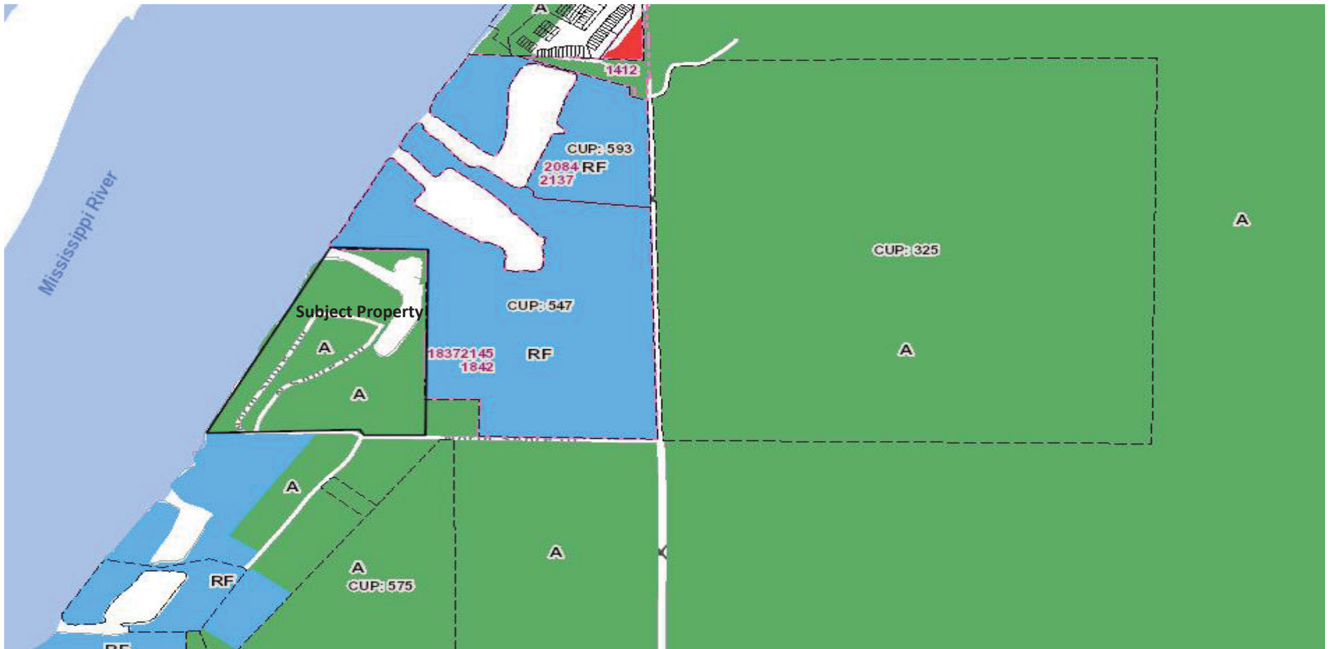
RZ20-17 - Zoning