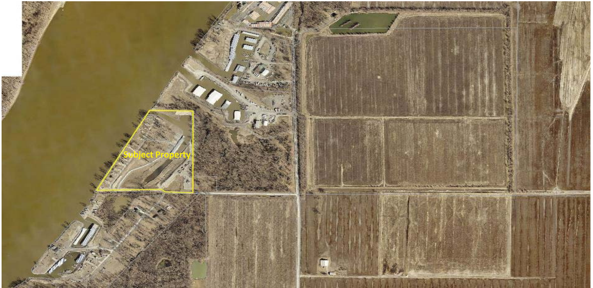
RZ20-17 - Aerial