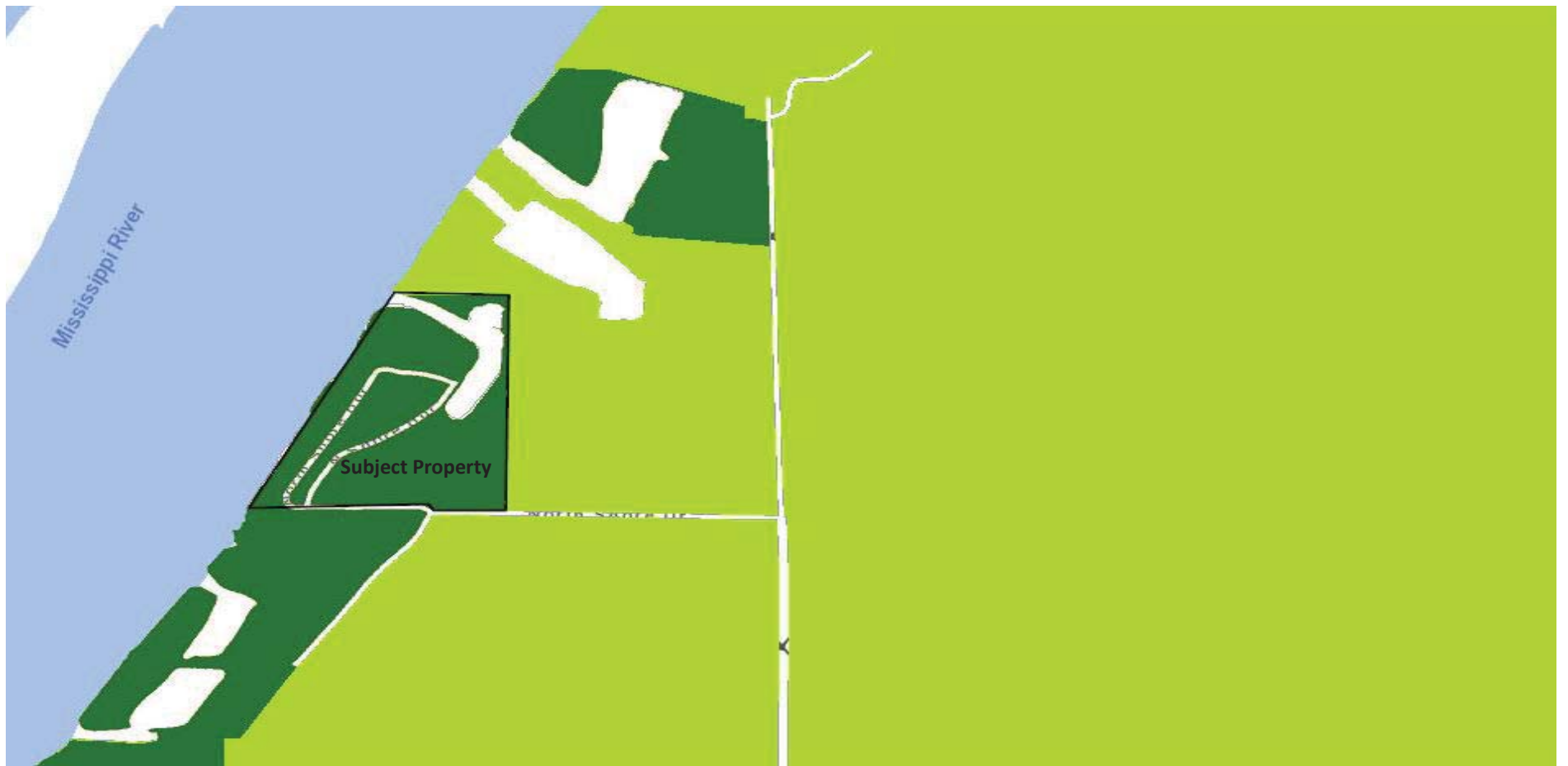
RZ20-17 - 2030 Land Use