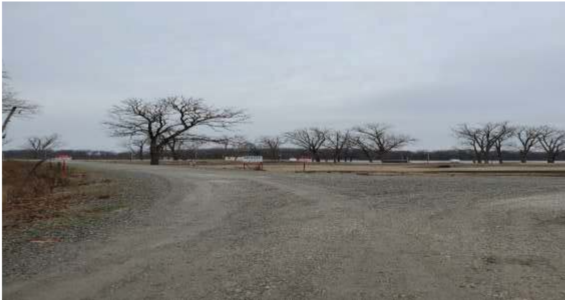
222 Yacht Club

The Planning and Zoning Division recommends that the Planning and Zoning Commission recommend approval of this application.